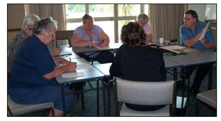
Clockwise from top right: Choir Practice, Introduction to Bridge, Balancing Your Life, Sudoku, Dinner, The Healthy Mind, Saturday Night Entertainment, Origami